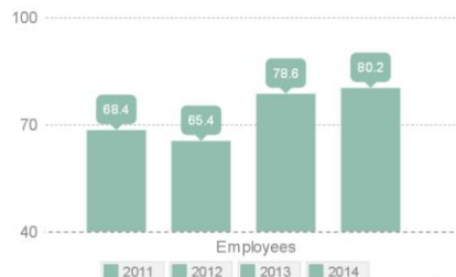
Number of employees (thousands)

Catalonia is recovering the volume of employment in the sector in recent years, especially thanks to the emergence of highly specialized small companies. It is a sector dominated by hiring women.