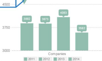
Evolution of the number of companies (BCN)